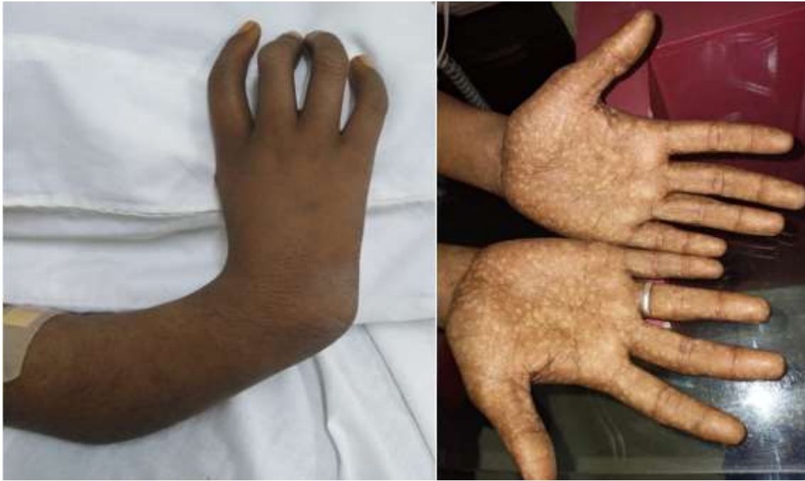
Figure 2. The Phenotypic abnormalities. Left figure represents a radial ray anomaly with an absent thumb; Right figure shows Café au lait spots on the hands